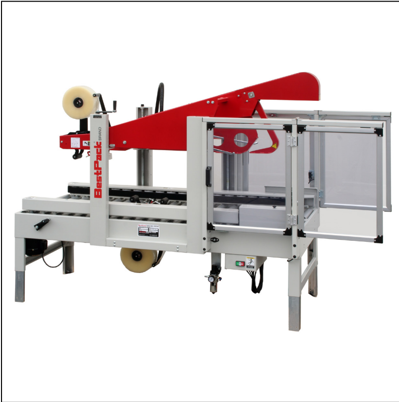
AS Automatic Uniform Sidedrive