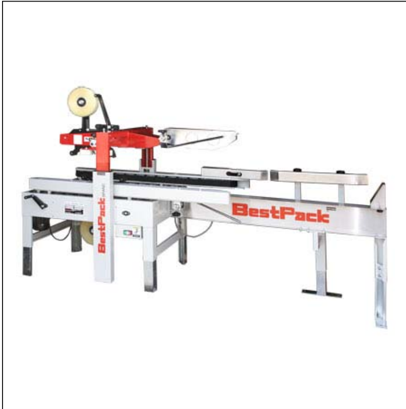
MSDBF22 Manual Side Drive