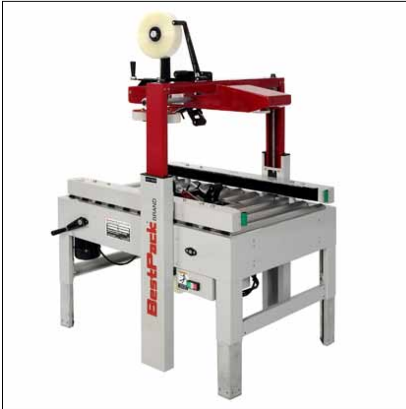
MSD22 Manual Side Drive